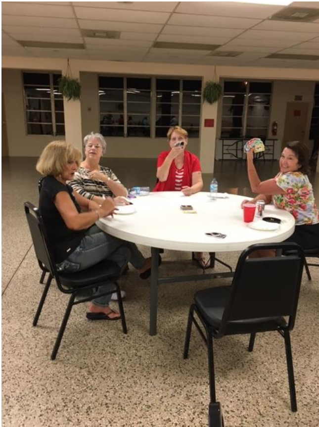
The ladies enjoyed a game of Uno.