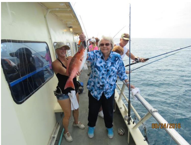
Pastime Princess (above).