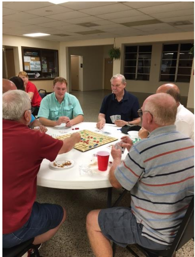
The guys concentrated on Sequence.